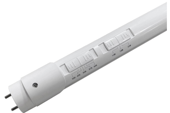
5X-CCT and 3X-Wattage Tuning Switches