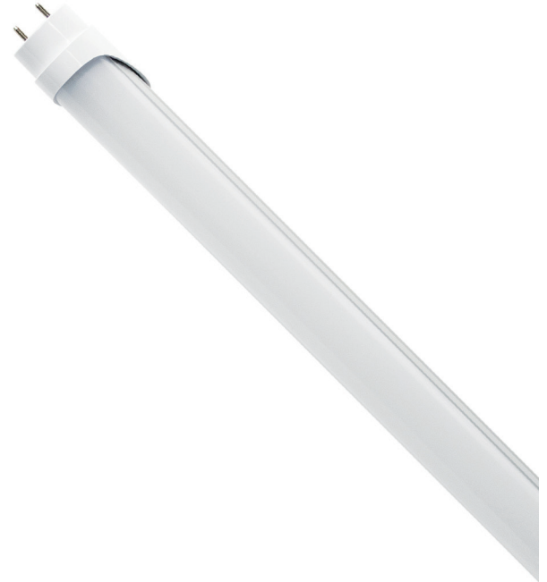
Tunable T8 4-FT Models

The Universal SERIES - LED Tunable T8 Tube, 4-FT, 150 lm/W, Select 5X-CCT (3500K, 4000K, 5000K, 5700K 6500K) and 3X-Wattages, Damp Location, Hybrid Type A+B, Single and Double Ended Power, Premium Replacement Lamp.